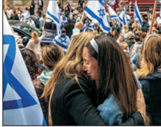
Hostages remaining in Gaza.

On Oct. 7, at least 1,500 Hamas fighters poured across the border from Gaza into Israel in a surprise attack that killed about 1,200 people. There were 240 people, from infants to octogenarians, taken hostage by Hamas. Some were released over a period of days but, according to the latest figures from the Israel Defense Forces, there are believed to be 136