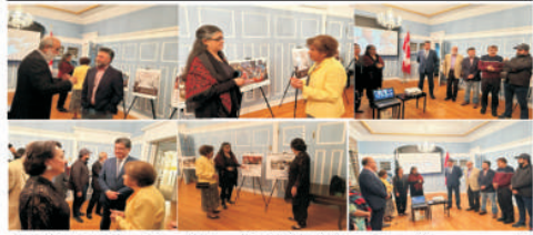
The Pakistan High Commission in Ottawa and the Consulates General in Montreal, Toronto and Vancouver observed "Kashmir Black Day" and organized Photographic Exhibitions