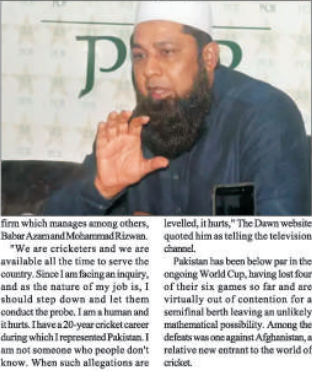
Inzamam-ul-Haq, former captain and chief selector, is shown in a meeting.

The PCB earlier said, "Pakistan Cricket Board (PCB) has set up a five-member fact-finding committee to investigate allegations in respect of conflict of interest reported in the media pertaining to the team selection process. The committee will submit its report and any recommendations to the PCB Management in an enclosed manner. We are cricketers and we are available all the time to serve the country. Since I am facing an inquiry, and as the nature of my job is, I should step down and let them conduct the probe. I am a human and it hurts. I have a 20-year cricket career during which I represented Pakistan. I am not someone who people don't know. When such allegations are