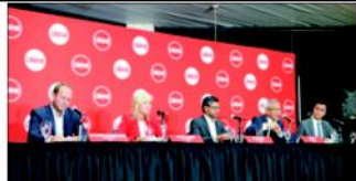
Erskine-Smith criticized Crombie for past statements about governing "right of centre" and her track record on housing as mayor.

"You cannot elect a leader who one day says they're going to open the Greenbelt and the next day changes their mind," said Naqvi. "Or one who takes money from the same people who are donating to Doug Ford and says that somehow they're going to do anything different."