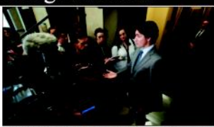
Prime Minister Justin Trudeau's government came to power, hundreds of government-appointed positions - from boards of port authorities and advisory councils to tribunals that hear licence claims or parole cases - are vacant or are being occupied by someone whose appointment has continued past its end date.

Almost eight years after Prime Minister Justin Trudeau's government came to power, hundreds of government-appointed positions - from boards of port authorities and advisory councils to tribunals that hear licence claims or parole cases - are vacant or are being occupied by someone whose appointment has continued past its end date. Nearly 5 mm (0.20 inches) of rain over the weekend helped prevent the flames from spreading while swirling winds tended to push the fire back on itself, Westwick said. More rain was expected but would likely bring with it potentially fire-starting lightning strikes. "This is all pretty good news, except for the lightning," Westwick said. Yellowknife officials warned city employees, first responders and volunteers who remained behind to be aware of wildlife displaced by the wildfires. In a message posted Sunday on Facebook, officials said bees and other animals have been reported running the mostly empty city. Canadian Prime Minister Justin Trudeau announced the approval of British Columbia's request for federal assistance.