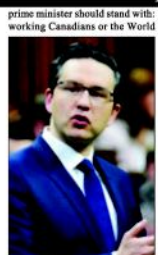
prime minister should stand with working Canadians or the World Economic Forum. The wording implies Trudeau's cabinet is beholden to the latter. Poilievre did not agree to an interview on the matter. His spokesman instead pointed the Canadian Press to a clip of him at a rally in Peñíscola, B.C. in July, expressing concerns over the

Conservative Leader Pierre Poilievre has been hitting the summer barbecue circuit with ramped-up rhetoric around debunked claims that the World Economic Forum is attempting to impose its agenda on sovereign governments. It is, some experts suggest, another sign that some conspiracy theories are moving from the fringes of the internet to mainstream thinking, as people's distrust of government grows. In speeches to Conservative supporters across Canada, Poilievre has promised that none of his ministers will attend the international organization's conferences, including the annual meeting typically held in Davos, Switzerland. "It's far past time we rejected the globalist Davos elites and bring home the common sense of the common people," said a Saturday fundraising email. The Conservative party also recently sent out mailers with a poll asking people to tell Prime Minister Justin Trudeau who they think the