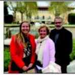
scenario in B.C., because of her trip to the States.

By her calculations, she believes she had surgery approximately three months earlier than the best-case