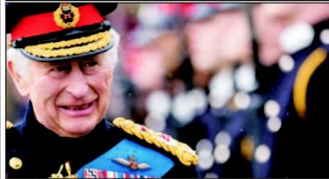
With the formal coronation of King Charles less than two weeks away, a new survey suggests Canada's new monarch could have a tough road ahead when it comes to winning over Canadians - and support for his wife, Camilla, appears even weaker.

Though the May 6 event is likely the first coronation many Canadians will have a chance to watch themselves - the last one was when Charles's mother, Elizabeth II was crowned 70 years ago in 1953 - the number of Canadians who say they're looking forward to watching the event is small.