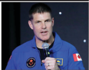
mission as a towering symbol of limitless potential for Canada, elbow-to-elbow with the U.S.

President Joe Biden articulated the vision last month in his speech to Parliament, seizing on the Artemis