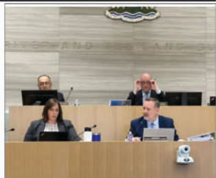
The operating budget covers the cost of city services like snow removal, transit and agencies like the Windsor-Essex County Health Unit.

The city's original proposed tax increase of 5.02 per cent was lowered by councillors through Monday's debate and review of departmental requests and other budget reductions.