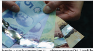
In order to give businesses time to plan.

McNaughton said the government is indicating the Oct. 1 increase now