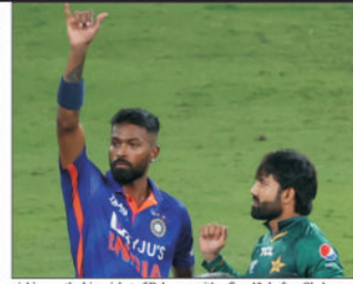
Hardik Pandya played a crucial role in India's victory over Pakistan. He scored 35 runs and hit three boundaries and a six in the final overs.

Asia Cup 2022, India vs Pakistan Highlights: Hardik Pandya showed nerves of steel to steer India to a thrilling five-wicket win over Pakistan in an Asia Cup Group A match at the Dubai International Stadium. Chasing a target of 148, Hardik hit three boundaries and a six in the last two overs to take India home with two balls to spare. Pandya remained unbeaten on 33, while both Virat Kohli and Ravindra Jadeja played knocks of 35 each to give India a decent platform. Earlier, Bhuvneshwar Kumar and Hardik Pandya starred with the ball as India bowled out Pakistan for 147 in the Asia Cup clash in Dubai.