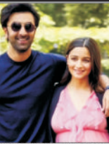
Ranbir Kapoor and Alia Bhatt are currently promoting their film Bahamini. In an Instagram chat with fans, the actor referred to his wife's baby bump and said, "Well I can say somebody has failed" (aka inflated) as a joke. But it seems that the comment did not go down well with social media users who trolled the actor and called the statement misogynistic, insulting, and in bad taste.