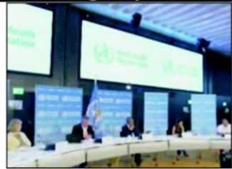
The WHO and international partners to strengthen the global response to the current monkeypox outbreak."

Monkeypox: World Health Organization declares public health emergency of international concern "PHAC continues to work closely with international, provincial and territorial health partners to gather information on this evolving outbreak and to assess the possible risk of exposure of the monkeypox virus in Canada," the statement said. "Canada will continue to work with