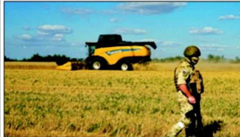
A Russian soldier guards a field as foreign journalists observe the wheat harvest near Melitopol in southern Ukraine last week. Canada collects a 35 per cent tariff on all Russian imports, including farm fertilizer shipments, in retaliation for Russia's invasion of Ukraine.

Toronto dancer recounts painful experience with monkeypox. Avoiding close physical contact with someone who is infected or may have been exposed to the virus, maintaining good hand hygiene, and cleaning high-touch surfaces are other ways to help reduce the risk of becoming infected, according to PHAC.