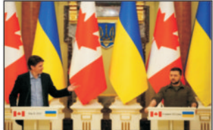
government would place sanctions on Russian individuals and entities.

At the news conference, the prime minister also announced that all duties on Ukrainian imports to Canada would be removed for the next year and that the federal