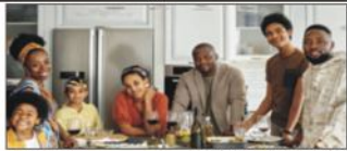
niece or grandchild

IRCC states you can sponsor an orphaned brother, sister, nephew, niece, or grandchild if all of these conditions are met: