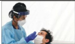
Minister for Indigenous Australians, Tok Repenart.

"Aboriginal people were deemed to be vulnerable communities, vulnerable groups in the vaccine rollout. And clearly that has failed," Linda Burney, Labour's Shadow