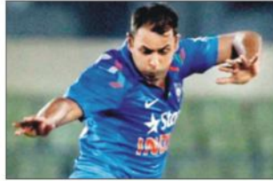
Stuart Binny was picked for India's ODI team for the tour of New Zealand in 2014. He played his first ODI during that tour. On June 17, 2014, Binny scalped six wickets conceding only four runs surpassing Anil Kumble to have the best bowling record for every Indian bowler. He made his Test debut against England in the tour of England 2014 and he then made his T20 debut for India against Zimbabwe in 2015.

India all-rounder Stuart Binny has announced his retirement from international and first-class cricket. Binny played 6 Tests, 14 ODIs, and 3 T20Is for the country and he also recorded figures of 6-4 in an ODI match against Bangladesh in his career. "I would like to inform you that I have decided to retire from first-class and international cricket. It has given me tremendous joy and pride to have represented my country at the international level," said Binny in an official statement. "I would like to acknowledge the huge role that the BCCI has played in my cricket journey. Their support and faith over the years has been invaluable. My cricket journey would not have even started had it not been for the Karnataka state and their support. It has been an honour to captain and win trophies with my state," he added. Further in his statement, Binny