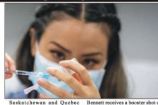
Saskatchewan and Quebec previously announced plans to offer additional doses of mRNA vaccines - not because of waning immunity or the threat of delta, but for people who want to travel to countries that may not recognize mixed-vaccination status.

The tides have shifted rapidly on this issue over the past week and many Canadians may now be left wondering whether they'll need an additional shot - and when they'll get it.