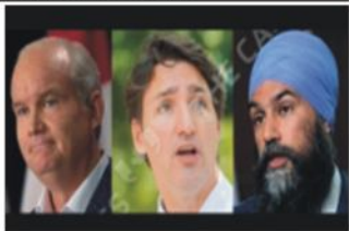
Singh said he would have sped up evacuations and made the paperwork process simpler for Canadian allies wanting out of Afghanistan. "The process that Justin Trudeau had put in place required people filling out an online form," he said. "It was complicated, it was bureaucratic. When we've got an imminent humanitarian crisis, that is not the way to respond."

Singh paid tribute to Layton and his legacy and then took aim at Liberal Leader Justin Trudeau's response to the situation in Afghanistan. Choosing his words carefully, Singh said he wondered if the timing of Trudeau's election call has inhibited Canada's ability to help its allies in a country through which chaos since it fell to the Taliban this