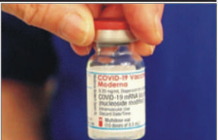
The government also says it will not accept anymore Johnson & Johnson doses until an inspection of a Baltimore production facility that produced the previous batch. While Canada is poised to receive millions of vaccine doses this week, Prime Minister Justin Trudeau announced the conclusion of the G7 summit in Britain on Sunday that Canada would be donating 13 million surplus jabs to poorer countries struggling to vaccinate their populations. Trudeau said the donations would not affect Canada's own immunization efforts. "This global commitment on vaccines is in addition to and in parallel with our vaccine rollout at home," he said. "We have millions of doses being delivered into the country each week, and every day more and more people get their first and second shots."