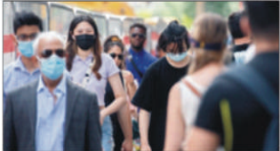
from around the world reported to the WHO have declined for seven weeks in a row, but he noted that deaths aren't falling as quickly. "The number of deaths reported last week was similar to the previous week," he said. In the Asia-Pacific region, Japanese Prime Minister Yoshihide Suga said he felt reassured by other Group of Seven leaders showing "firm support" to his determination to host the Tokyo Olympics next month. Suga told reporters while in Britain for the G7 Summit that he explained to other leaders Japan's commitment to ensure through virus control measures that the Games would be safe and secure. "I'm feeling reassured by the firm support I received from all the other leaders," Suga said Sunday before heading back to Tokyo. "I have renewed my determination to make the Tokyo Games a success at any cost." Many Indian states eased restrictions including Delhi, as the number of new infections dropped to the lowest in more than two months. In Africa, Kenya has received a $750 million US loan from the World Bank to support its budget and help the East African economy recover from the effects of the pandemic, the multilateral lender said. In the Americas, Mexican health officials said the country will receive its first shipment of J&J vaccines on Tuesday. Latin American nations' capacity to fight corruption diminished over the past year as the pandemic absorbed resources and offered politicians in some countries the space to weaken judicial bodies, according to a report. In the Middle East, Lebanon has vaccinated a daily record of people against COVID-19, raising the total number of shots administered around the country against the virus to more than 1 million.