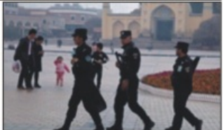
China has denied all reports of human rights abuses in the region, claiming that the camps are vocational training centres aimed at fighting terrorism.

The statement said mounting evidence shows the Chinese state is responsible for seriously impairing more than one million people on the basis of their religion and ethnicity, and for subjecting them to "political re-education, forced labor, torture and indoctrination."