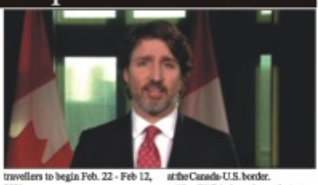
travellers to begin Feb. 22 - Feb. 12, 2021. According to the CBSA data, in the weeks since the additional measures were implemented, the number of people flying into the country has dropped significantly - by 55 per cent.

Between Feb. 22 and March 14, there were a total of 65,253 travellers by air, a 43 per cent drop. However, land travel has jumped by 8.9 per cent during the same time period, despite new measures in place