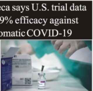
before the agency decides whether to allow emergency use of the vaccine.

The earlier U.K., Brazil, South Africa trials had a more variable and inconsistent design and it was thought that the U.S. FDA would not approve the use of the AstraZeneca vaccine on this basis, but now the U.S. clinical trial has confirmed the efficacy of this vaccine in their own clinical trials," he said.