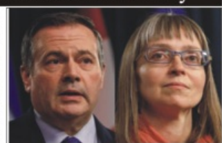
Alberta Premier Jason Kenney (left) and a cabinet member (right) are expected to meet Monday to decide whether to further ease public health restrictions.