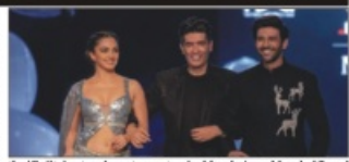
Kartik Aaryan and Kiara Advani walking the ramp as a showstopper couple for Bollywood designer Manish Malhotra.

The fourth day of the digital Lakme Fashion Week 2021 fashion extravaganza kicked off on Saturday night with actors Kiara Advani and Kartik Aaryan walking the ramp as a showstopper couple for Bollywood designer Manish Malhotra.