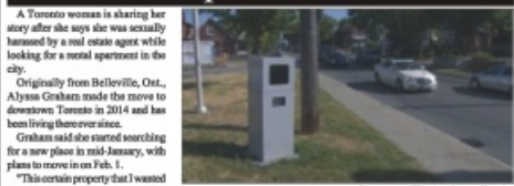
A Toronto woman is sharing her story after she says she was sexually harassed by a real estate agent while looking for a rental apartment in the city.