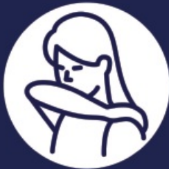
Cough into your sleeve