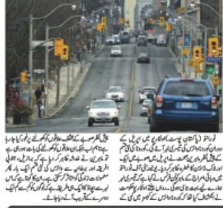
اوتاروی ایک ہفتے کے لیے مارچ بریک ملتی کرے گا

اوتاروی ایک ہفتے کے لیے مارچ بریک ملتی کرے گا بازار کی جانب ہندو کی بجائے ایس این ایل کی ہولڈنگ کا ہندو کا پکارا ہے۔