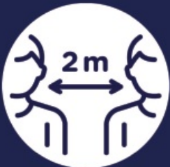
Keep your distance