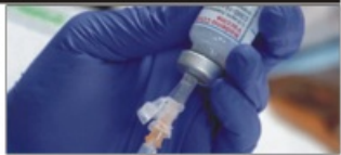
Person in protective gear, likely a healthcare worker, is shown in a clinical setting.

The province has identified "very high priority" health-care workers as those who work in acute care and other hospital settings not already identified in the previous category, along with those who work in congregate and