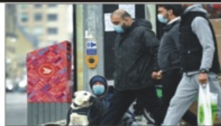
People are gathered outdoors, possibly in a shelter or community center.

A statement from the Prime Minister's Office said the two leaders "spoke about India's significant efforts in producing vaccine production and supply, which have provided vital support to countries around the world." "The two leaders agreed to work together on access to vaccines," it said.