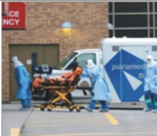
claiming fears about COVID-19 than warning the alarm.

Public health officials and political leaders seemed to tilt more toward