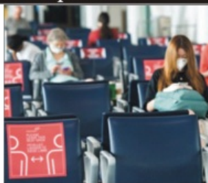
comes to travelling that taking a trip would be extremely difficult.

"While a travel ban is not in effect, there are now so many rules when it