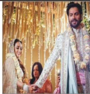
The fans are ecstatic for the heartthrob and his wife. With Manish Malhotra, Karan Johar, Kunal Kohli, and more in attendance, there was a few surprise guests expected to attend the ceremony. Congratulations to the newlyweds!