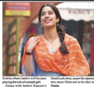
Good Luck Jerry, as per the reports, two more films are to be shot in Patiala. Along with Janhvi Kapoor's

Janhvi Kapoor has currently been shooting for Good Luck Jerry in Patiala. The actress came across a group of agitated group of protesting farmers. The scenes and her entire unit faced a lot of difficulty during their shooting schedule while the shoot on Bhindranwala Road. A group of farmers protested outside the shoot location and started chanting slogans like 'Janhvi Kapoor go back'.