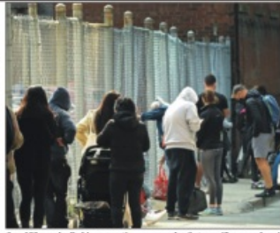
More than 100 people died in connection with the virus daily. Those numbers have remained much lower in recent months, with five deaths reported on Friday.

While a second wave of COVID-19 infections has started, Alzema points out that deaths are not in a second wave. COVID-19 deaths in Canada peaked in April and May, when more