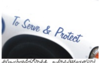
To Sewe & Protect

ایٹالیا میں فائرنگ، ایک شخص ہلاک، ایک شدید زخمی ایٹالیا میں فائرنگ، ایک شخص ہلاک، ایک شدید زخمی۔ ایٹالیا میں فائرنگ، ایک شخص ہلاک، ایک شدید زخمی۔ ایٹالیا میں فائرنگ، ایک شخص ہلاک، ایک شدید زخمی۔