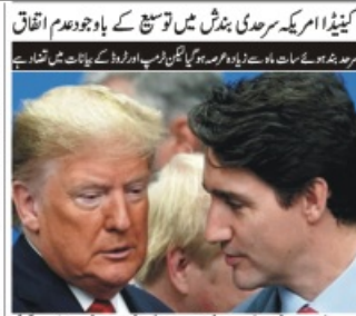
کیڈیڈا امریکہ سرحدی بندش میں توسیع کے باوجود اتفاق سرحد بند ہوئے سات دو ہزار سے زائد امریکی اور دو لاکھ سے زائد پاکستانی تاجر ہیں۔

کیڈیڈا کے پاس ایک سو شٹ آؤٹن سے پہلے کے بہت لمبے طرے ہیں۔ ٹیڈو کیسز کیلئے ایک سو شٹ آؤٹن سے پہلے کے بہت لمبے طرے ہیں۔ ٹیڈو کیسز کیلئے ایک سو شٹ آؤٹن سے پہلے کے بہت لمبے طرے ہیں۔