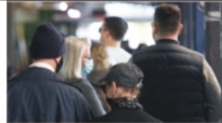
said the new cases in the Atlantic provinces were related to travel outside the region.

Ontario reported the second-highest number of new cases Sunday at 658, while Manitoba had 44, Saskatchewan logged 24, New Brunswick posted five and Nova Scotia had two. Health authorities