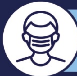
Cover your face

Mandatory for people age 10 and over on public transit and in most enclosed and partially enclosed public places .