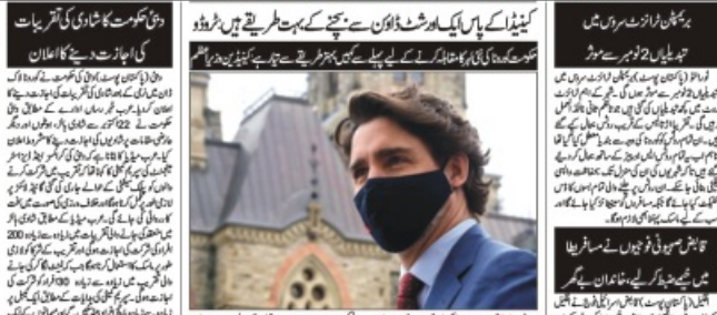
کیڈیڈا کے پاس ایک سو شٹ آؤٹن سے پہلے کے بہت لمبے طرے ہیں۔ ٹیڈو کیسز کیلئے ایک سو شٹ آؤٹن سے پہلے کے بہت لمبے طرے ہیں۔ ٹیڈو کیسز کیلئے ایک سو شٹ آؤٹن سے پہلے کے بہت لمبے طرے ہیں۔

کیڈیڈا میں گورنرنا کیسز تعداد دو لاکھ کے قریب پہنچ گئی ہے۔ زیادہ سے زیادہ سے کیسز کیس میں آئے ہیں جبکہ اور ہر گھر پر ہے۔