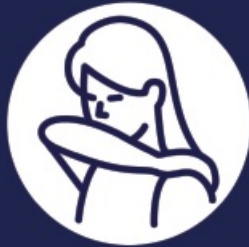
Cough into your sleeve