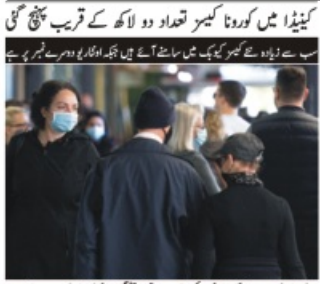
کیڈیڈا میں گورنرنا کیسز تعداد دو لاکھ کے قریب پہنچ گئی ہے۔ زیادہ سے زیادہ سے کیسز کیس میں آئے ہیں جبکہ اور ہر گھر پر ہے۔