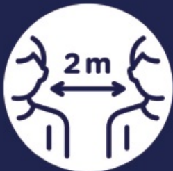
Keep your distance