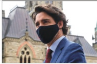
Trudeau says the most vulnerable communities and that work needs to be done to protect those populations.

Trudeau says that since enlisting the military, both Ottawa and the provinces recognize that long-term care