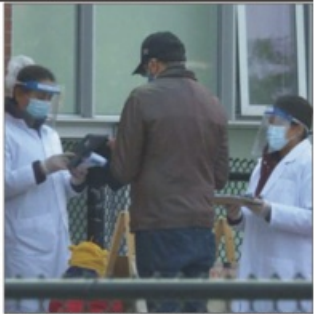
Other five occurred earlier this month. So far, more than 2 million people in Quebec have been tested for the virus, while 51,700 have recovered.

All five confirmed cases in the Northwest Territories have also recovered. However, a spokesperson from the