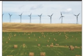
which makes the cost low.

Rystad forecasts Ontario will have about 1.8 GW solar and 5.8 GW wind in 2025. The said Alberta's commitment to stop burning coal to generate electricity by 2030 "opens the door" for wind and solar to play a larger role. He also said the province's deregulated electricity market creates a favourable environment for solar and