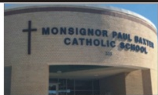
Two students at St. Leonard School in Manotick, one student at Holy Spirit School in Stittville and one student at Holy Cross School near Mooney's Bay have all tested positive for the virus.

and family members would also be set up on the school's grounds Monday and Tuesday.