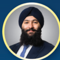
Prabmeet Sarkaria MPP - Brampton South prabmeetsarkariamp.ca