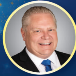
Doug Ford MPP - Etobicoke North fordmpp.ca