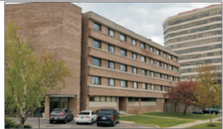
public health officials and comply with their guidance and directives.

It alleges that the homes did not adequately plan for the virus, did not supply staff and visitors with sufficient personal protective equipment, did not appropriately screen visitors and staff, and did not follow the leadership of