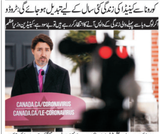
CANADA CA / CORONAVIRUS CANADA CA / LE-CORONAVIRUS

کورونا سے کیڑیا کی زندگی کی سال کے لیے تبدیل ہو جائے گی: مہرزدو کورونا جیسا کہ پہلا دنیا کی تاریخ میں پہلا ہیجینا کا وائرس تھا۔ اگرچہ یہ آج کے ہیجینا کی نسبت زیادہ خطرناک ہے۔ یہ بھی ہے کہ ہائیجینا سے بچنے کے لیے ہمیں کئی کام کرنا پڑیں گے۔ پھر اس کی نگرانی کو سنجیدگی سے کرنا پڑے گا۔ یہ بھی ہے کہ ہائیجینا سے بچنے کے لیے ہمیں کئی کام کرنا پڑیں گے۔ پھر اس کی نگرانی کو سنجیدگی سے کرنا پڑے گا۔