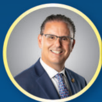
Rudy Cuzzetto MPP - Mississauga—Lakeshore cuzzetto.com