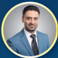
Amarjot Sandhu MPP - Brampton West amarjotsandhu.com