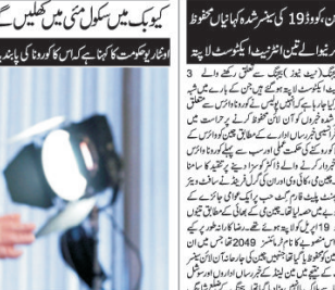
CANADA CA / CORONAVIRUS CANADA CA / LE-CORONAVIRUS

کیویک میں سکول میں تین گھنٹوں کے امتحان پر تیار کیویک میں سکول میں تین گھنٹوں کے امتحان پر تیار۔ کیویک میں سکول میں تین گھنٹوں کے امتحان پر تیار۔