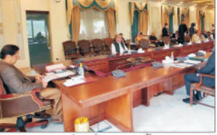
ذرا مختصر بیان کے ساتھ پاکستان کی عدالتوں میں جرم ثابت ہونے پر