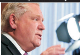
all workplaces open and further relaxing rules on public gatherings - though large ones such as sports events and concerts would still be restricted.

Ontario says its plan to ease COVID-19 restrictions will happen in three stages, though the steps unveiled today contain few specifics