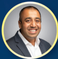
Kaleed Rasheed MPP - Mississauga East—Cooksville kaleedrasheed.com