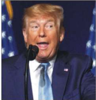
Donald Trump.

Meanwhile the Trudeau government is saying little about what plans it might have to withdraw Canadian military members who were taking part in a NATO training