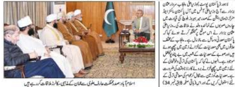
اسلام آباد، صدر عدالت عالیہ جج عدنان کے ساتھ ملاقات کے بعد عدالت کے باہر