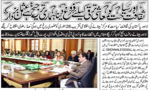
لاہور پاکستان کی تقاضا کیلئے قومی ایجنسی کے سربراہان کی ایک پریس کانفرنس کے دوران