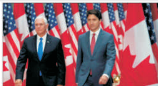
W. Freeland directly addressed whether Trump's latest action provokes the U.S. could still slip tariffs on Canadian products.

Mexican President Andrés Manuel López Obrador told a daily news conference that the tariff threat "does not stop the process that