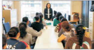
trafficking in Canada

Investigation: How foreign workers fall prey to a sprawling web of labour