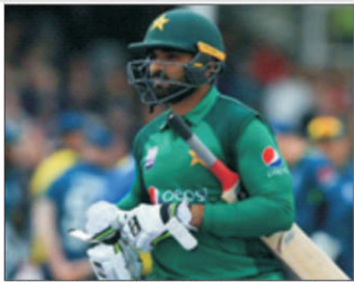
ODI in Bristol. The hard-hitting batsman has scored 342 runs in 16 ODIs at an average of 31.09.

Asif Ali featured in every game of the ODI series, scoring two fifties with a career best of 52 in the third