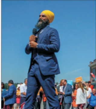
Tom Mulcair flashing an uneasy grin as "pragmatism" drove the party into 2015 electoral oblivion.

The Type is supported by readers like you Join us and grow independent media in Canada With Singh previously opposing one pipeline (Trans Mountain) while simultaneously supporting another (Coastal GasLink), Orange had become indistinguishable from Red, giving New Democrats déjà vu of