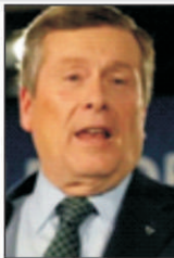
Toronto Mayor John Tory says estimates of cuts will cost $178M this year.

They are weighing tax hikes, service cuts and/or delaying capital projects to make up for the losses.