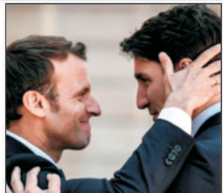
Charlie Angus speaking at a podium.

"The budget was vague on purpose, but the cuts are very, very clear and they're very, very painful," she said.