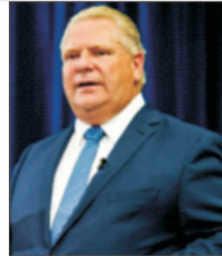
"campaigning on making child care more affordable and accessible, while ensuring parents have the flexibility and choice to make the best decisions for their family."

During campaign, Ontario PCs promised partial subsidy of daycare costs, even for high-income families