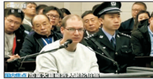
On Monday, Mr. Schellenberg issued a request for an appeal in a document he wrote himself, an unusual feature of the Chinese justice system, where an application for what's called a "second-instance" trial is largely a formality.

Mr. Schellenberg was arrested in 2014 and sentenced to 15 years in prison in November, 2018. However, Chinese authorities quickly ordered a retrial on more serious drug-related charges in late December, following the arrest in Canada of Huawei executive Meng Wanzhou.