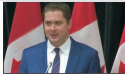
Canadians won't exceed their parents' levels of wealth.

In his address, Scheer focused on balanced budgets, the carbon tax, and the fear that younger generations of