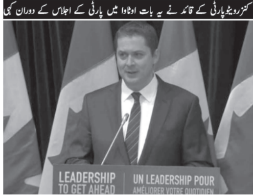
جسٹین ٹروڈ کا خطاب کرتے ہوئے۔