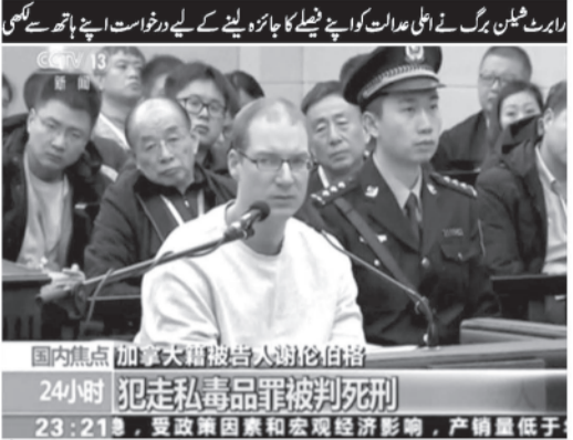
ٹورانٹو (پاکستان پوسٹ) کینیڈا کے ایک شہری...