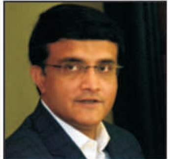
"I am sure whoever has done it will realise that and come out as a better person. We are all human beings. We are not machines that everything you put in comes out perfect. You have just got to live life and let others live. They are responsible people. They may be role models but they are under pressure all the time to perform. Certain things happen in life and as everyone, we should move on and make sure that it doesn't happen again."

Asked if modern day cricketers should be responsible while giving statements on a public platform as a whole lot of youngsters look up to them, Ganguly said: "I haven't watched that episode. I watch 'Comedy Nights with Kapil'. Jokes apart, I feel that you can't generalise that only modern day cricketers should behave responsibly. People make mistakes. Let's not get too far into that."