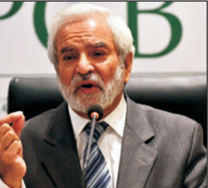
to bring about new blood in the sports. He said the country lacked a structure that could train the youngsters in sports starting from the school level. He said the international women team was doing good but new players were not being injected into it.