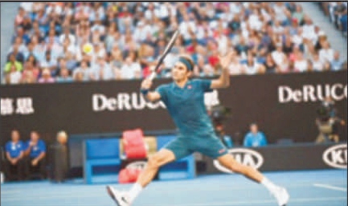
been idolising him [Federer] since the age of six. It was a dream come true for me just being on Rod Laver facing him. Winning at the end, I can't describe it."

Wimbledon winner and 2016 champion Kerber, the bookies' favourite along with Serena Williams after defending champion Caroline Wozniacki was ousted early, was no match for Collins, ranked 35 in the world.