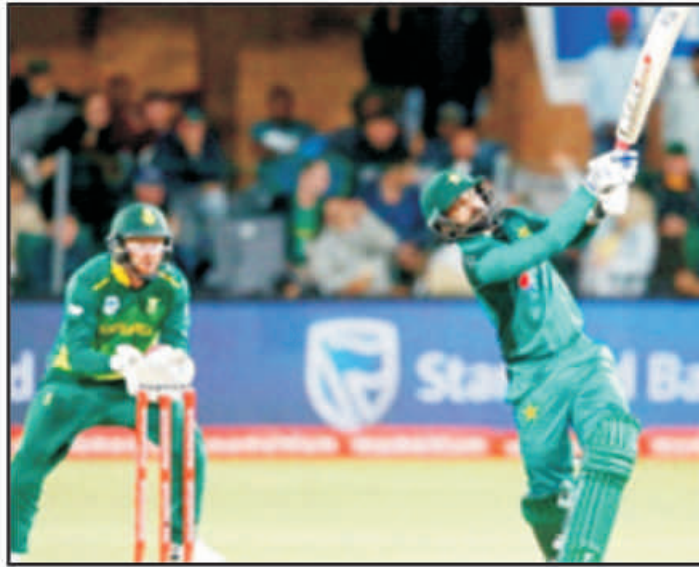
leg-spinner Shadab Khan bowling particularly well. They took one for 42 and one for 41 respectively in their ten overs.

Scoring was slow during the middle overs with seamer Hasan Ali and